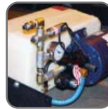
Remote power supply

The FreightLite is a proven winner. It's made to smoothly and economically move loads weighing up to 6,000 lbs. from one level to another – typically to and from a mezzanine. The FreightLite is one of the best values in the industry. There's no pre-installation and set-up is quicker than competitive models.