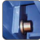
Sealed cam follower rollers