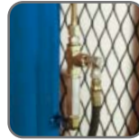
Velocity fuse for freefall prevention and safety