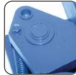
Safety cams to limit carriage freefall to 4"