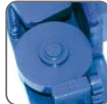
Lubricated-for-life bushings on guide rollers