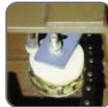
Slack Chain Safety Stop

Mechanical Freightlifts are designed to stop at multiple positions to access heights up to 100 feet and to have more precise control of their stop-start movements. They are mechanically operated by means of a brake motor and gear reducer with a common drive shaft. Raising and lowering of the carriage platform is accomplished with heavy-duty roller chain.